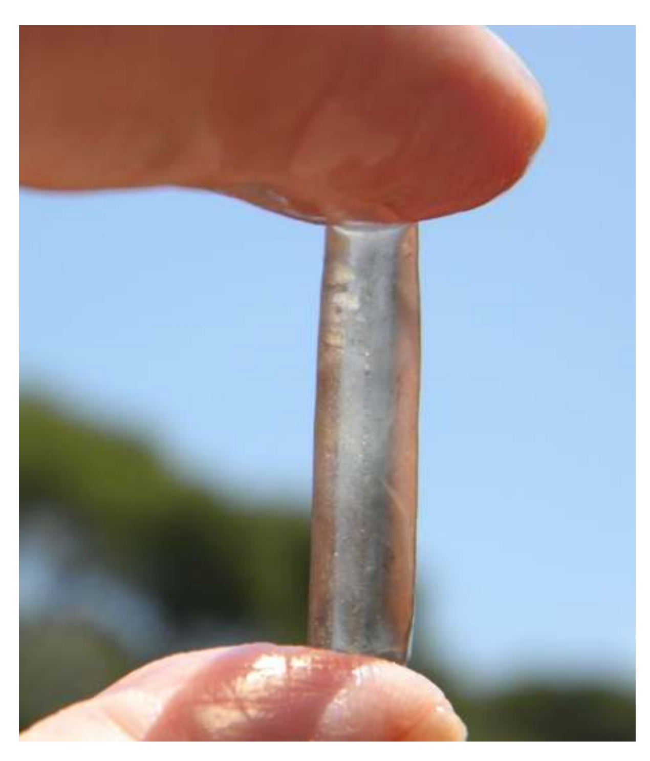
Clear quartz crystal point