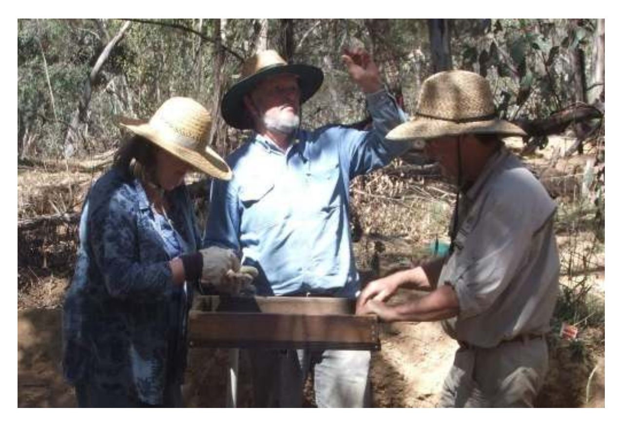
Fossicking for Jellybean Crystals at Stannifer Creek