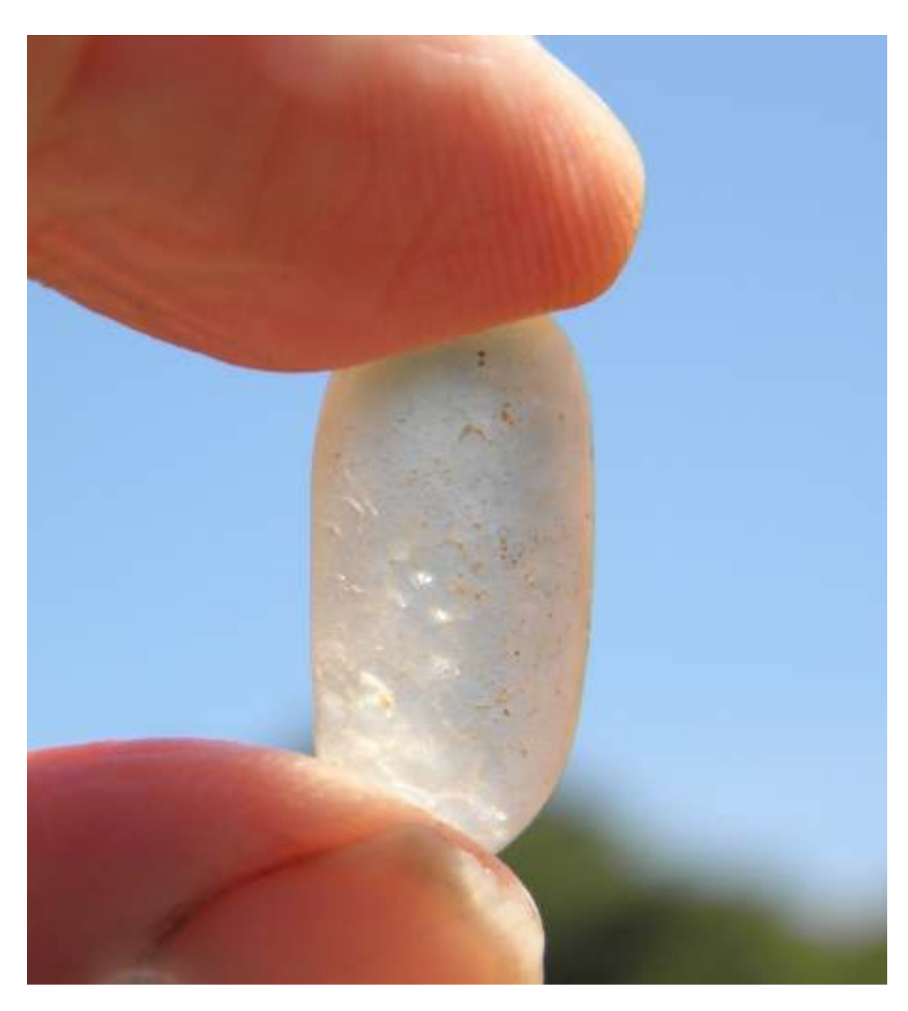
Nice little clear jellybean