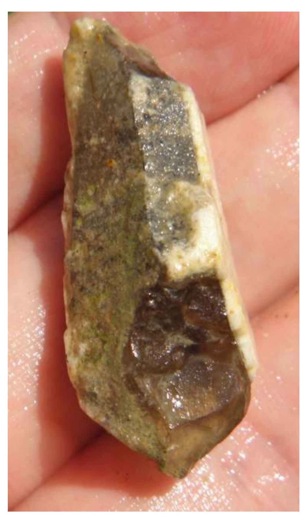
Not the best but a candle quartz

To return to web site click on:- http://illawarralapidaryclub.com.au/