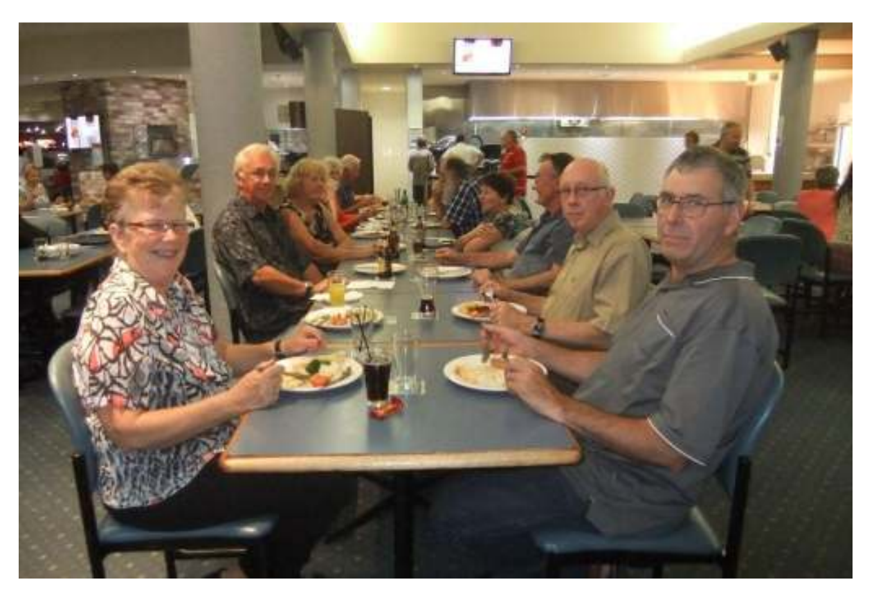
Dinner at the Inverell RSM with the fossicking group