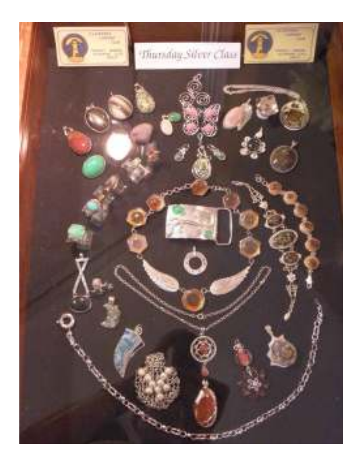
Thursday for silver working including casting