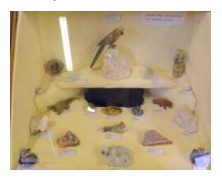
Part of a members vast collection of mineral, gem and other stone items.