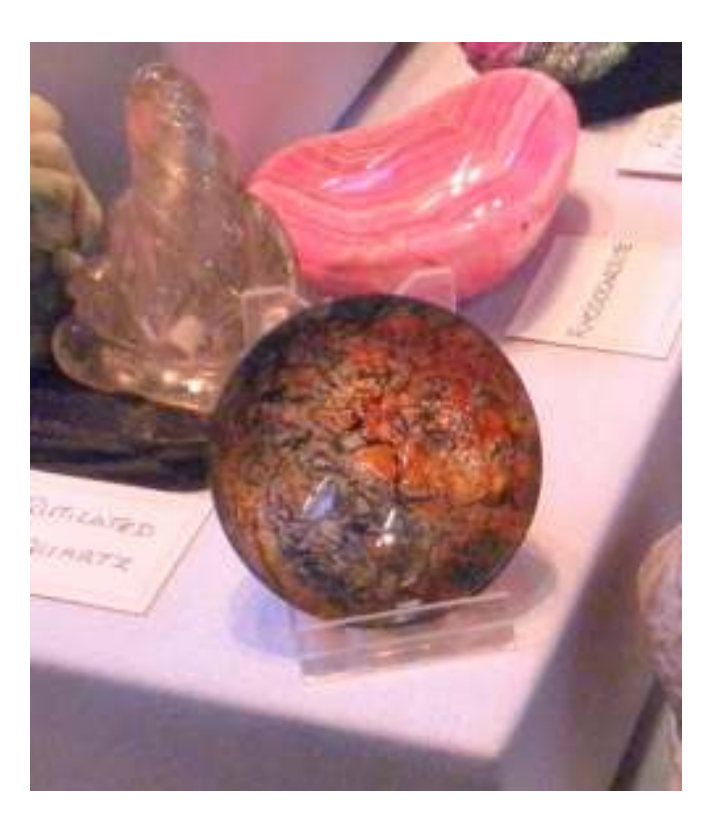
Just look at the thickness of the small bowl - its only about 2mm thick all out of the solid stone - Fantastic