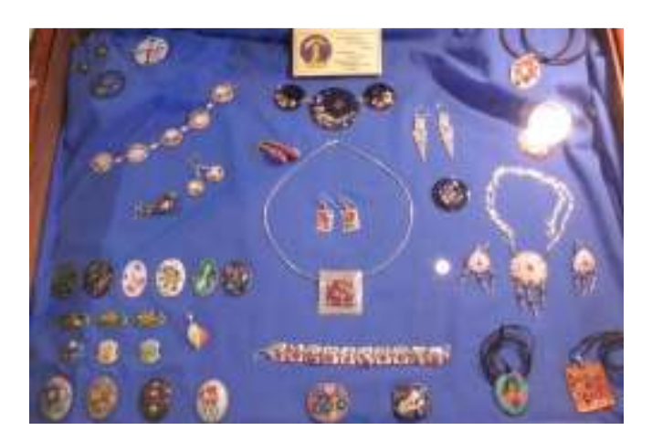
The newest class - enamelling