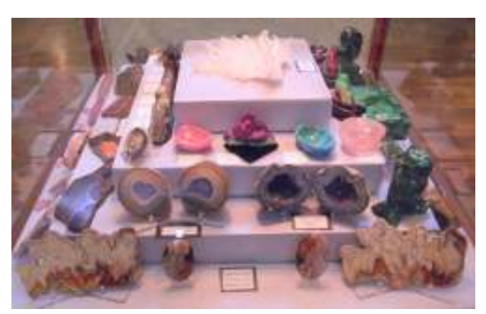
Now some of the items slightly closer