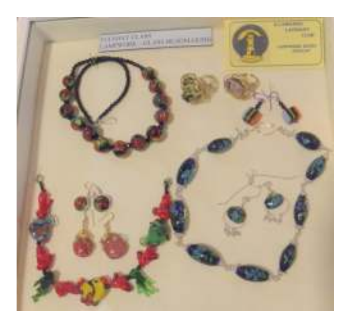
Another new class - Lampwork and glass bead making