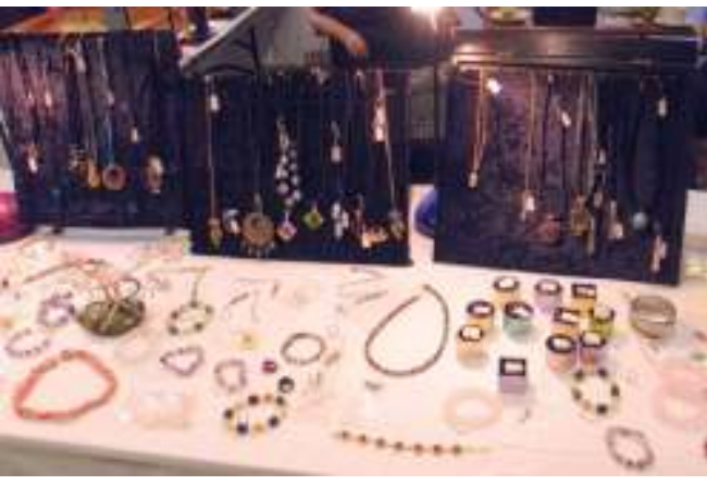
Some of club members items on sale at the club table